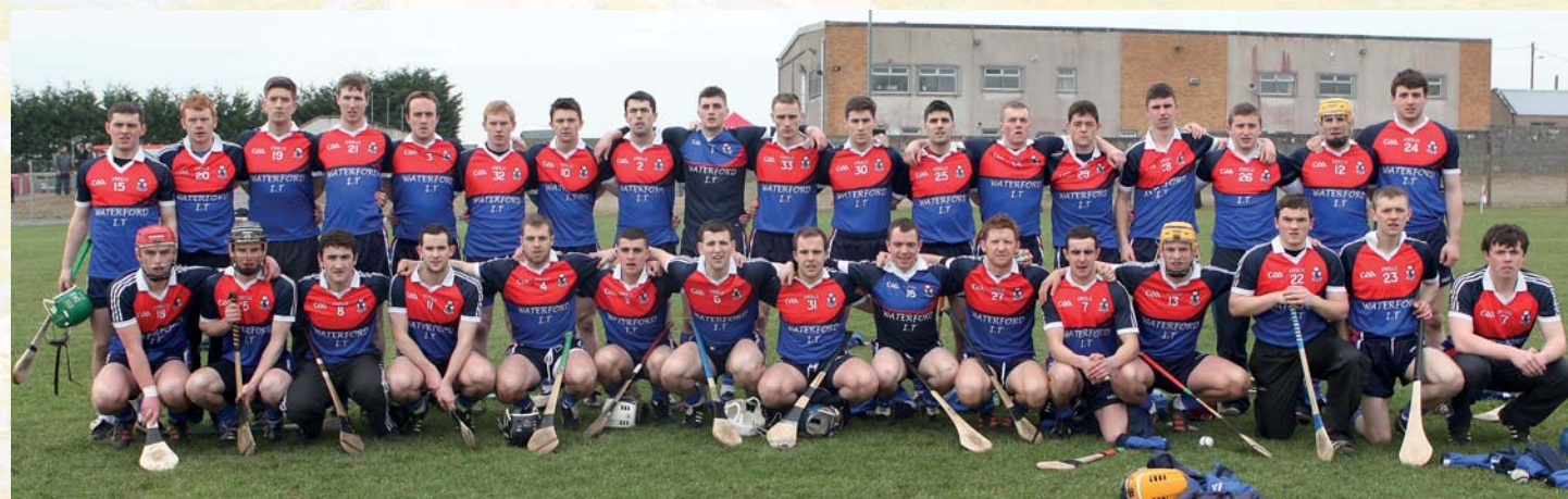
WIT's Fitzgibbon Cup 2013 panel

Coupled with this initiative and the recent success of local club Gaultier in capturing the Division 2 National Feile title the future for Waterford underage camogie is looking good.