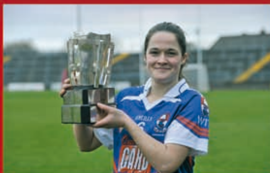
ASHBOURNE CUP - Camogie

WIT's Inter-county players and Player Profiles