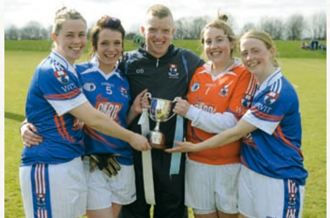
Wexford on Tour

We were now in the place we all wanted to be since the first training session in September and it would be IT Tralee who stood in the teams way and a place in history, the intensity in training