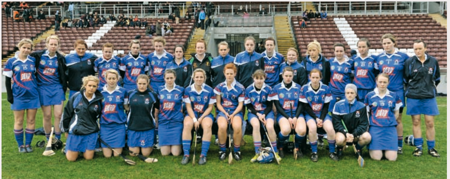
Ashbourne Cup Champions, 2011

There is something very special and almost magical about “three-in-a-row” in any sport and having won the Ashbourne Cup in 2009 and 2010 the management and players in WIT had a special aim and ambition in 2011. Admittedly, we took it “one game at a time” and always focussed on the immediate task in hand but there was that unspoken yearning to make our own bit of WIT history and bring the prestigious Ashbourne Cup and title back to Waterford for the third year on the trot.