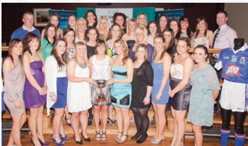
Ladies football team receiving their medals.