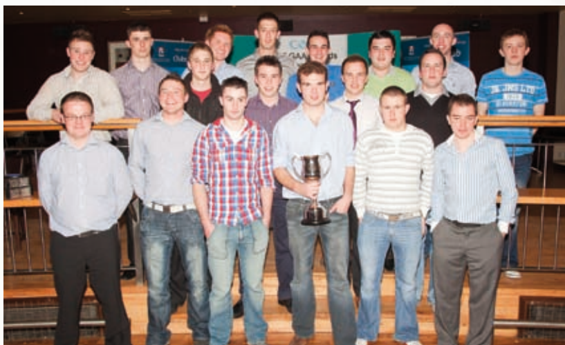
WIT intermediate hurlers receiving their medals.