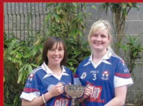
GILES' CUP - Ladies Football