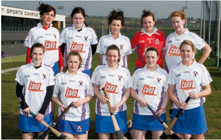
Fresher Camogie panel, 2011

The All Ireland CCAO Freshers competition for 2010/2011 season was played at a sun drenched Carriganore, home to WIT's new sports campus. With close to 100 first year college students in action and a total of nine teams competing this resulted in 22 games being played in all, a busy series of matches over the course of the day. Extra time was required in the cup semi final so as to separate the hosts WIT and a very spirited DCU side. UCC's first team went on to run out very convincing winners in the cup final and were crowned worthy