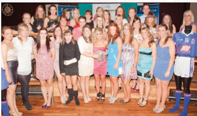
Senior camogie team receiving their medals.