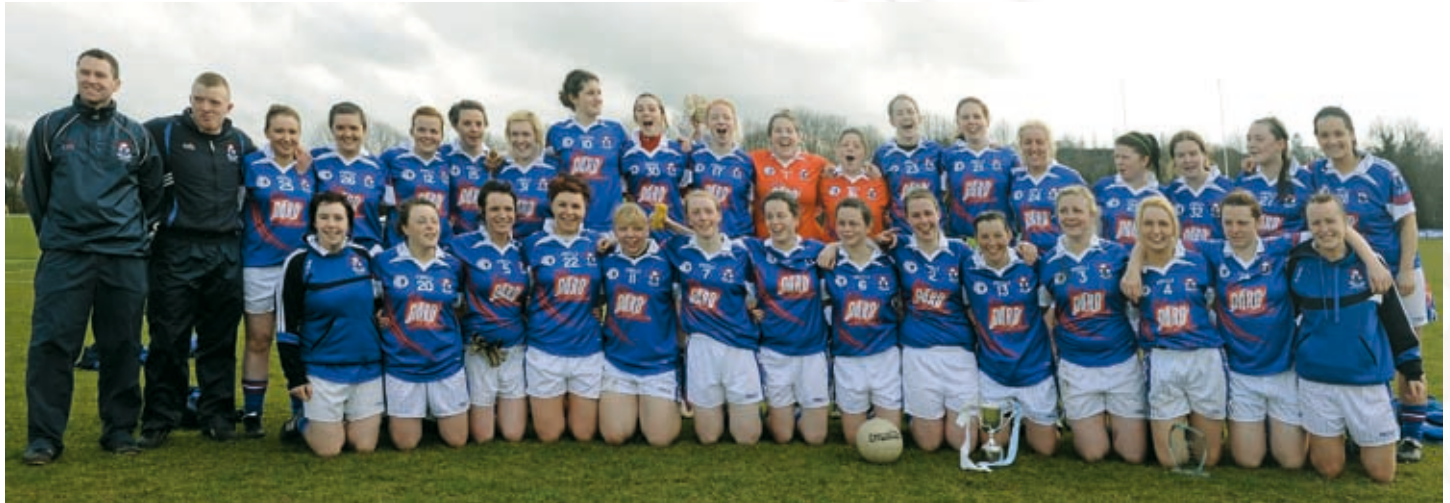
Giles' Cup Champions, 2011

The WIT ladies football team are the 2011 Giles Cup champions, this achievement capped a memorable championship campaign; a campaign where the WIT senior team fought for every ball, trained and played hard and won their first piece of 3rd level silverware in 12 years.