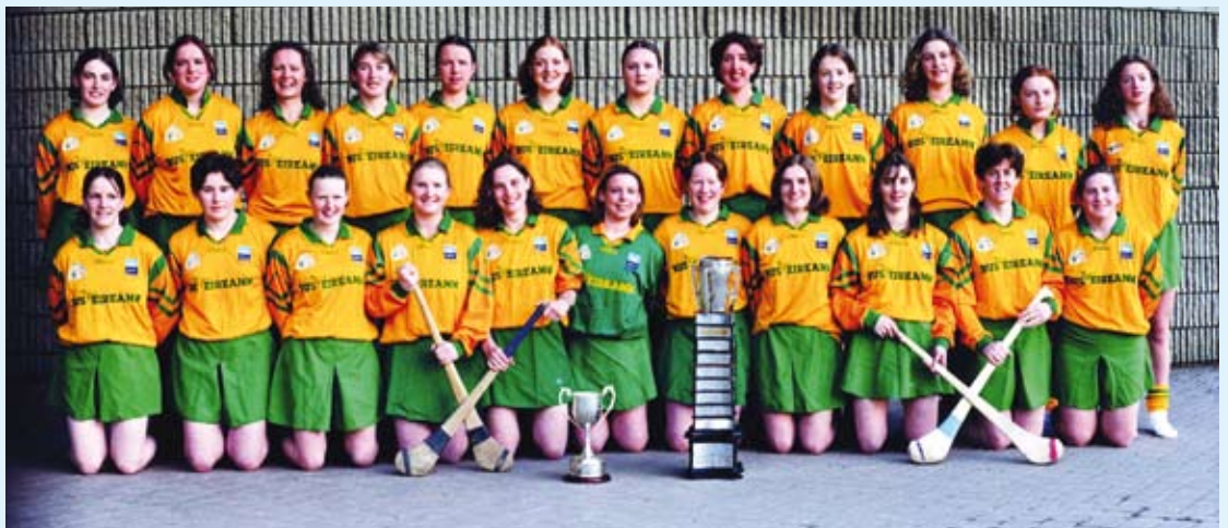
Ashbourne Panel of 1999

Camogie in WIT is on the rise once again and hopefully it will continue to do so in the foreseeable future. Ten years have gone by extremely quickly but in the space of these years, three Ashbourne titles and three league titles have been secured. Undoubtedly it is not alone the materialistic elements that these players treasure but the memories that were had, life long friendships that were made and predominantly the philosophy of WIT GAA club which has continued to strive in each individual long after their college playing days have elapsed.